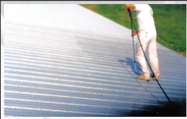
Cleaning can be done with pressure air, detergent or chemical wash, wire brush or whatever process is available. QUICK-DRY ANTI-OXIDENE COATING is easily applied to the roof by spray, brush or roller.