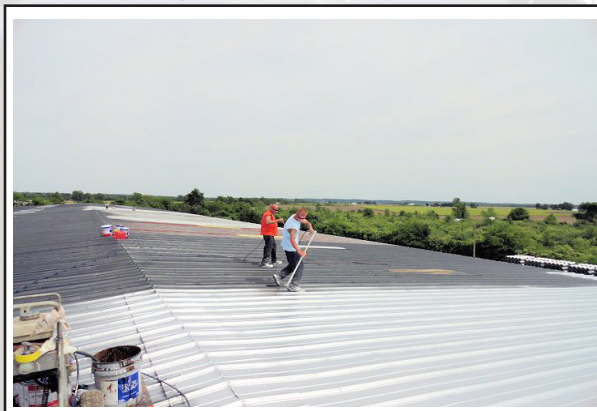
A beautiful cover of ALUMINUM ROOF COATING or TEXTOTROPIC FIBERED ALUMINUM ROOF COATING completes the job for ultimate protection.