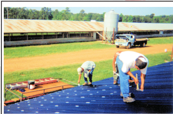
All fastener heads on this section of roof have been sealed with TEXTOTROPIC FIBERED ALUMINUM ROOF COATING. ALUMINUM QUICK-PATCH is used to seal seams and protrusions where necessary.